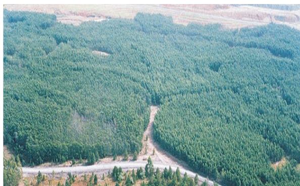
FIG 6 - Acacia Sp forestation area.