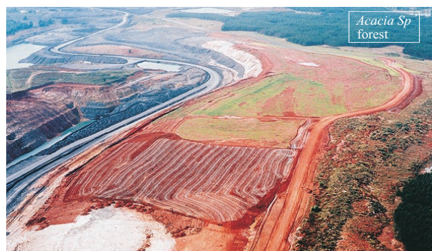
FIG 3 - Reclamation procedures undertaken during coal strip mining. At the top left, the pit developed during mining, at the centre erosion control and grass planting, at the top right Acacia Sp forested area.

Finding appropriate areas for domestic waste disposal is a worldwide problem, especially in large cities. All countries worldwide are facing the solid waste disposal dilemma at various degrees. For instance, Porto Alegre (the capital of Rio Grande do Sul), located 80 km from the mine, has a daily solid waste generation of approximately 1800 tonnes and there is no available land nearby to construct a new municipal solid waste landfill (MSWL). Considering this situation, Copelmi Ltd proposed a large MSWL in the mined out pit of Recreio Coal Mine.