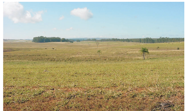
FIG 7 - Reclaimed area returned to the land owners for raising cattle.