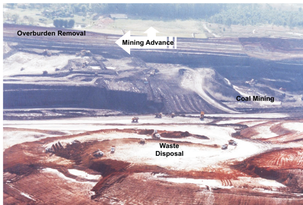
FIG 2 - Coal strip mining – (top) shows the mining advance, (middle) the coal seams being mined and (bottom) the waste disposal in the previous strip.

The strip mining starts with the removal of the top soil which is stored for rehabilitation of the area. Next, the overburden is removed by a mobile equipment fleet consisting of hydraulic back-hoe excavators and trucks. Interburden is removed using a similar method to overburden removal. The waste fill is placed in the previous strip mined area and is dumped in accordance with the original stratigraphy, thus ‘recomposing’ of the original terrain. Coal is hauled to the processing plant where distinct products are obtained. Figure 2 shows the main operations during the coal mining process.