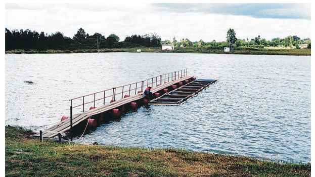
FIG 8 - Pond developed in an open pit where an experimental fisher farm was carried out.

Other areas followed approved reclamation plans, by planting native grass species and plants for general landscape rehabilitation. These areas were returned to their former owners for cattle farming (Figure 7). A few ponds were also constructed as a source of water for animals.