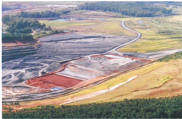
FIG 5 - MSWL daily operation. At the centre the landfill is receiving the domestic waste transported by trucks and it is covered by silty material levelled by a dozer on a daily basis.